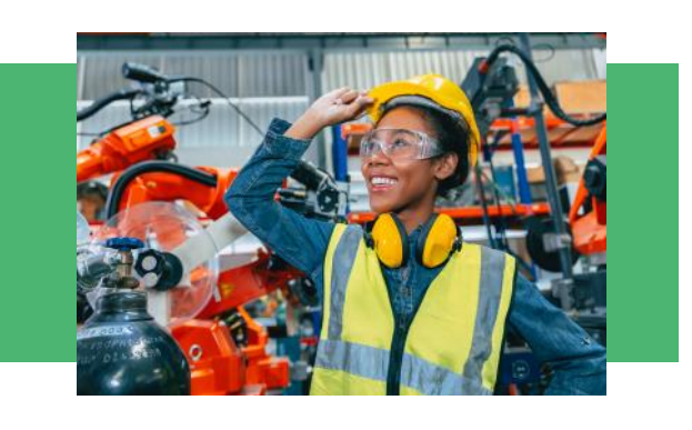
We Value Equity - Collaboration - Partnership